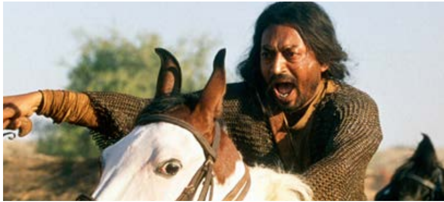
THE WARRIOR: IMAGES COURTESY OF PARK CIRCUS/CHANNEL 4